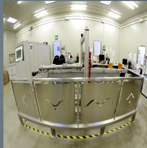
© Elettra Sincrotrone Trieste, photo by Roberto Barnaba, Kyma instrumentation

The National Institute of Oceanography and Applied Geophysics – OGS